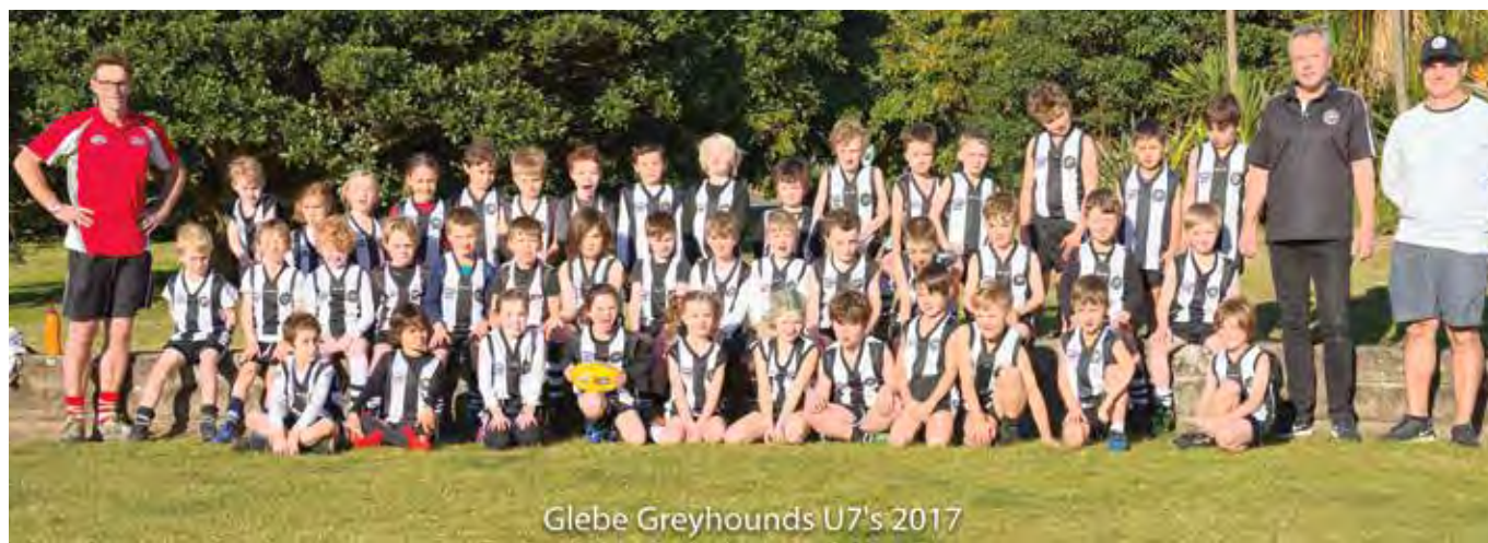
Glebe Greyhounds U7's 2017